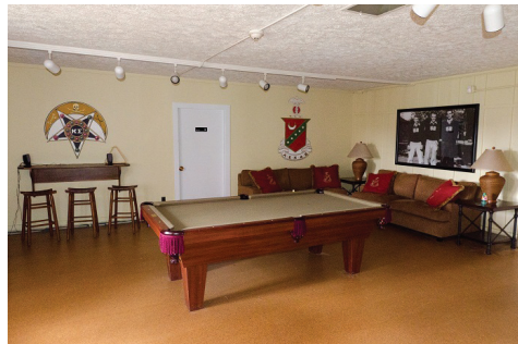
A look inside the newly-renovated Kappa Sig house. Find many more pictures at www.kappasigmadenison.com .