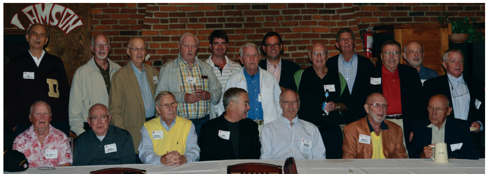
Gamma-Xi celebrated its centennial anniversary in September 2012.