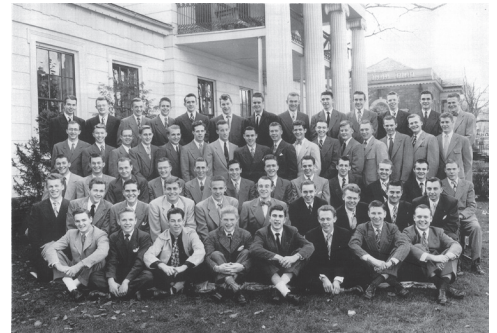
Many alums from the 50s attended the event.

The weekend events included a Friday after-